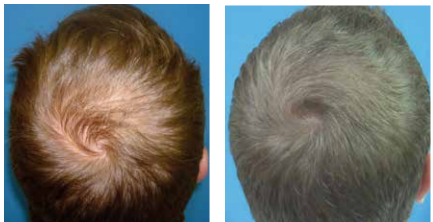
Figure 4 (A) Before and (B) 8 months after one session of platelet-rich plasma treatment

Greco and Brandt 17 found that traumatising and infusing growth factors into the scalp reversed miniaturisation over an 8-month period when compared with control. Ten hair samples were taken from each patient; five patients in the Control Group (CG) and five from the Treatment Group (TG). Hair diameter was measured using a Starrett micrometer. In the TG, 60 cc of blood was drawn and 10cc PRP was processed. The CG also had 60cc of blood drawn, but this was not processed. The scalp was first traumatised in both groups with a 1mm microneedling roller to initiate keratinocyte